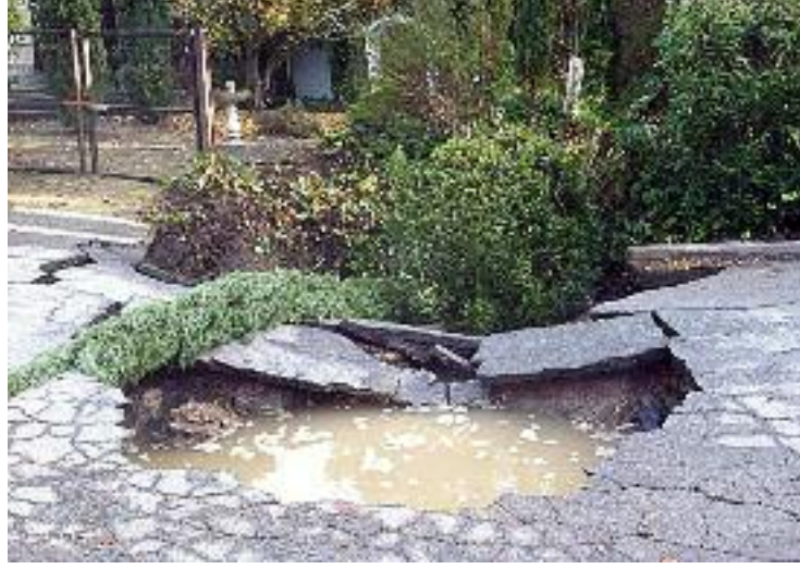
In December 2012, a pipe failure led to the formation of a sinkhole on Tarabrook Drive at Evergreen. Adopting humor in the face of adversity, some Orindans christened the area "Tarabrook Lake" during the worst mo-

city's Public Works Department began reviewing proposals in August 2013 from five firms hoping to perform a Master Storm Drain Study for the city. The study and resulting proposed Storm Drain Master Plan (SDMP) were completed by Schaaf & Wheeler. That plan is currently working its way through public reviews, including two recent Citizens' Infrastructure Oversight Commission meetings.